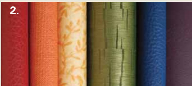
The Clean Living collection.