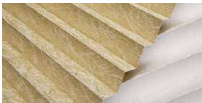
Scrabble 80262 and Circle 40706, two high-quality jacquard fabrics in the “Luxury & Comfort” collection.