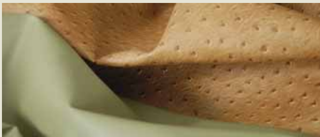
The Hyde Me collection.

2. Stretching the boundaries of style and comfort with vinyl and suede, two new collections from Silver State Inc.: