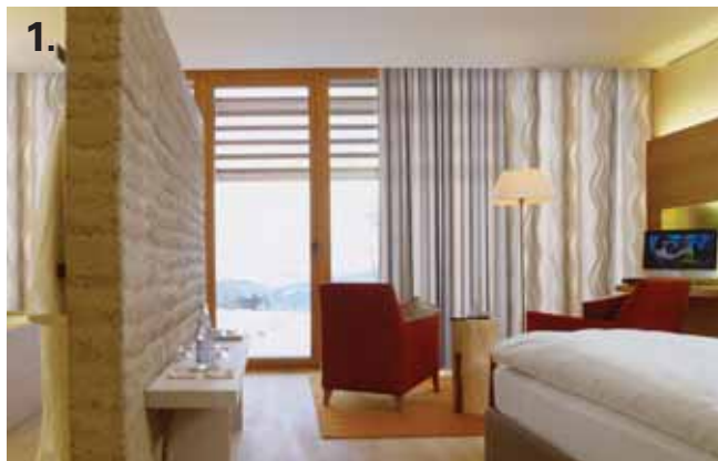
Patterns and colors in the “Design & Protect” collection are designed to coordinate with each other.

For information, contact Junkers & Müllers GmbH, Mönchengladbach, Germany; +49 2166 39390, fax +49 2166 390980, e-mail info@jm-techtex.com .